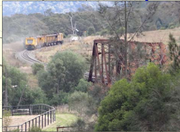
The railway between Sandy Hollow and Denman is still in use. The active railway corridor is not considered suitable for a 'trail beside the rail'.