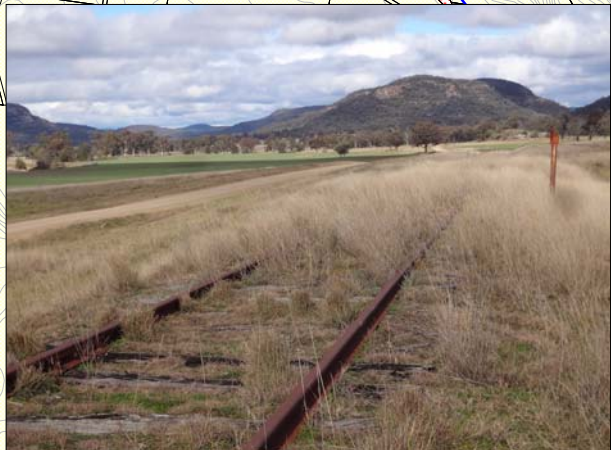
The railway corridor provides spectacular views of the surrounding landscape, giving potential future rail trail users an added incentive to travel to the Upper Hunter to ride or walk the proposed trail.