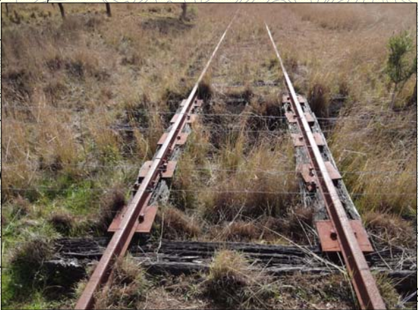
Cattle grids (or "cattle stops") were put in at road crossings and property boundaries to prevent stock from straying out of their farms. New structures will be required along the proposed rail trail.