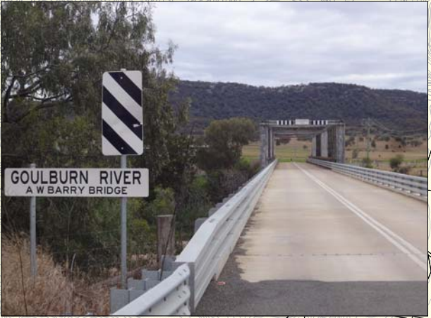
Existing road bridges would form part of the proposed on-road route between Sandy Hollow and Denman, as building new trail bridges would not be feasible.