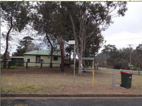
Options for a trailhead in Sandy Hollow are limited given that the original railway station has been removed. This park on the Golden Highway in the town centre will require some minor upgrading.