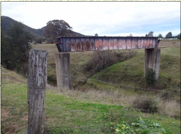
Major re-building of the (mostly) dismantled bridge over Halls Creek (near Sandy Hollow) will be an essential component of the trail building program. It will be a highlight of the rail trail should it proceed.