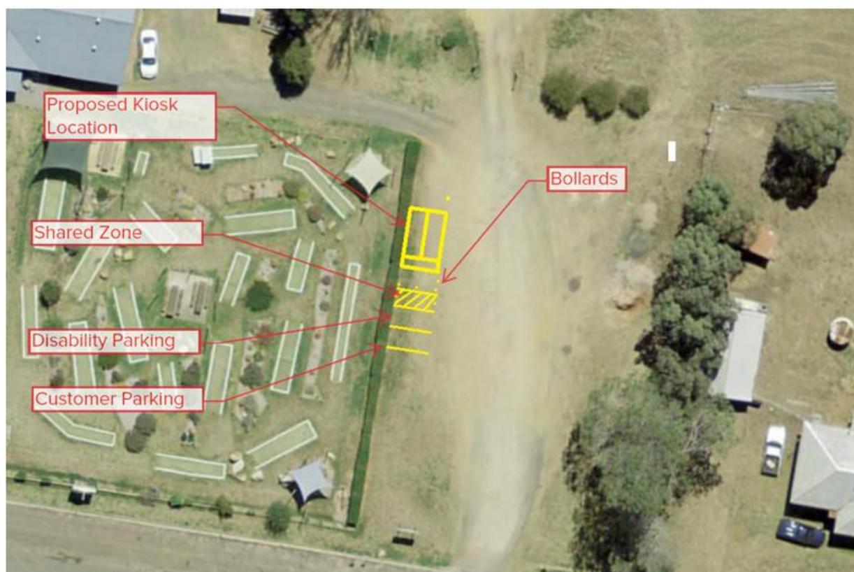
Figure 2 – Site Plan