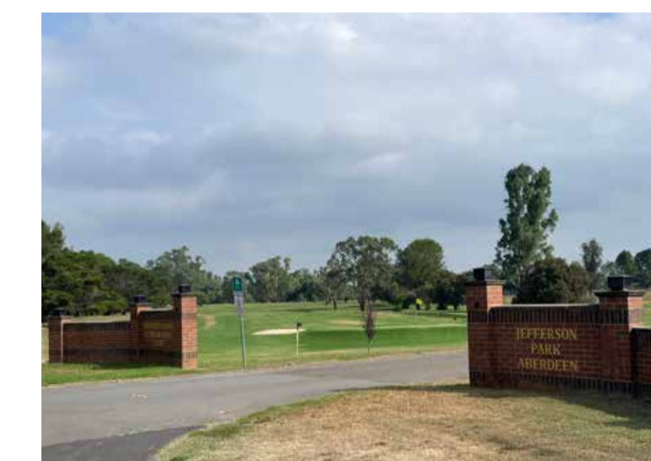
Existing Entrance & Signage