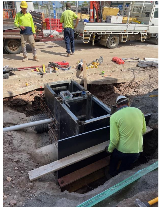
Block 2 East – Building Stormwater Pit