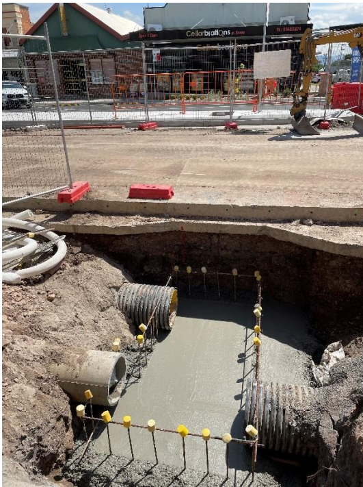
Block 2 East – Storm Water Pit Base