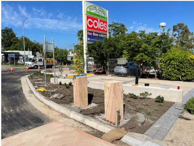
Block 1 West – Landscaping and Sandstone Posts