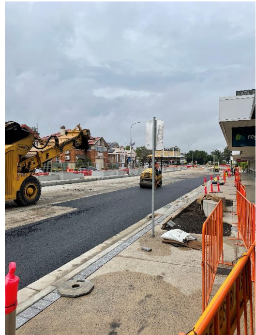
Block 1 West – Intermediate Asphalt Works