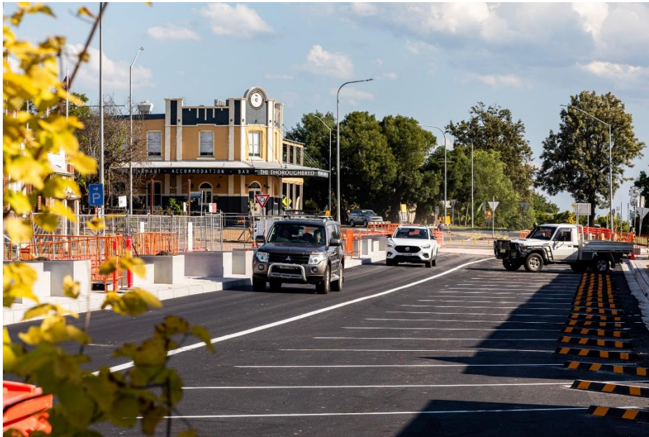
Block 1 West – Opened to Traffic, 22 February 2024