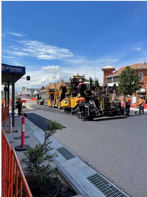
Block 1 West – Intermediate Asphalt Works