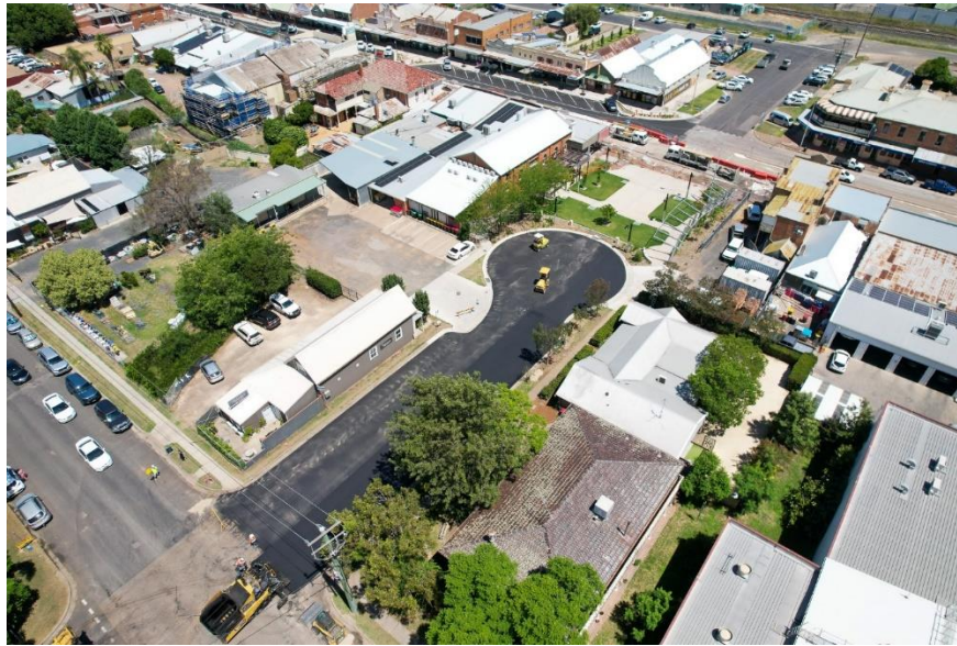
Sealing Works St Aubins Street