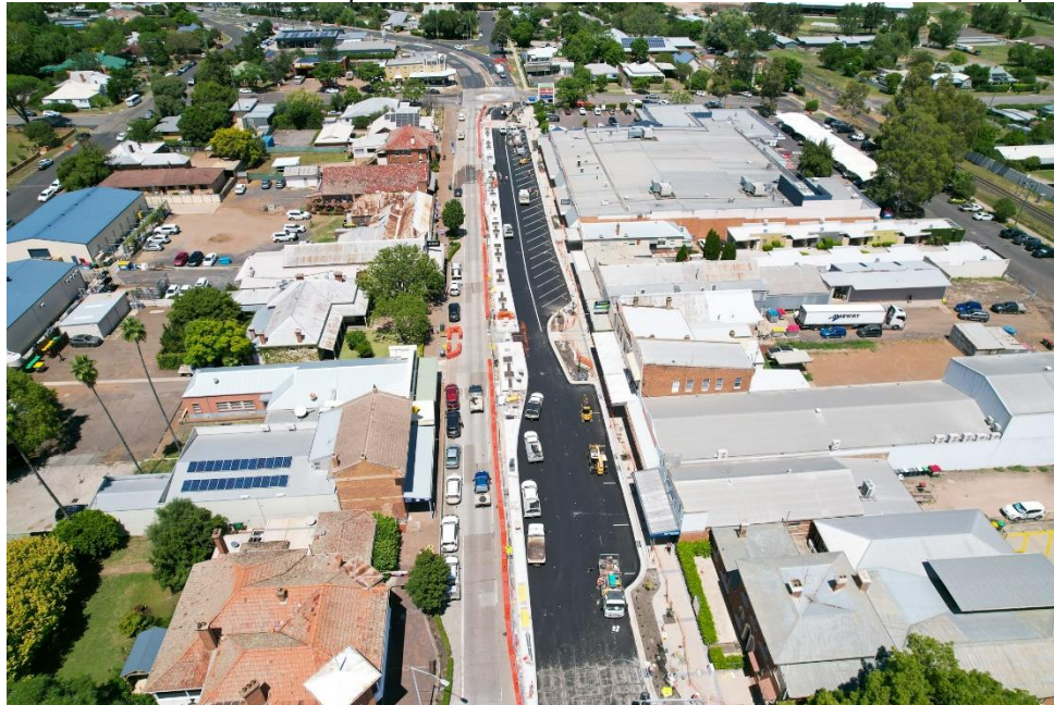
Block 1 West – Line Marking and Finishing Works