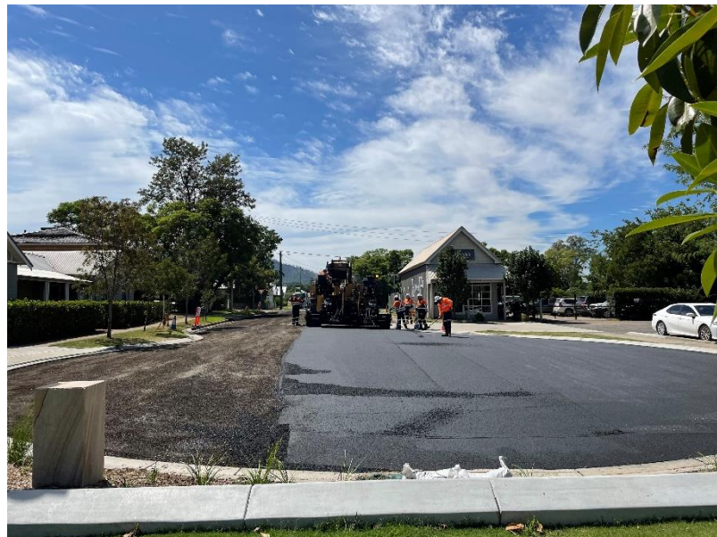
Sealing Works in St Aubins Street