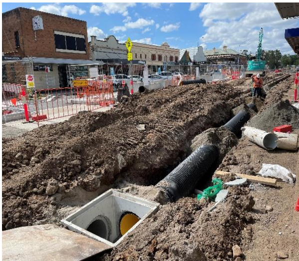
Block 2 East – Storm Water Drainage and Pits