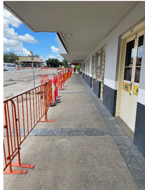
Block 1 West – Footpath and Paver Banding