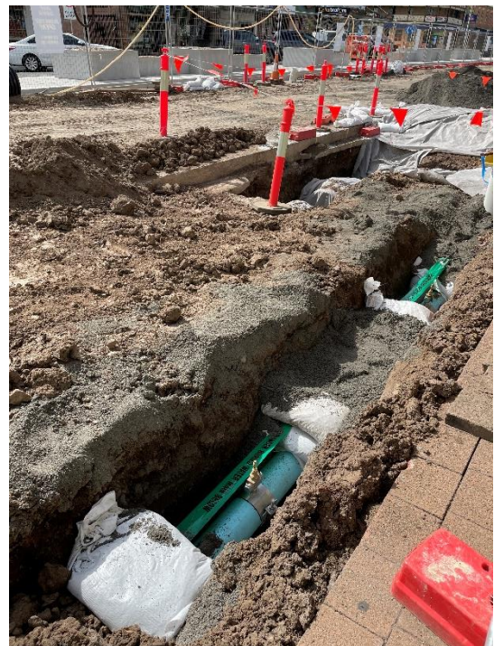
Block 2 East – Water Main Installation